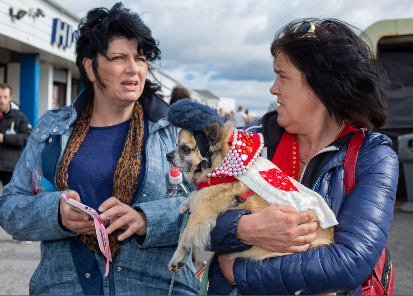
Image: The Ladies of Elvies Porthcawl 2019